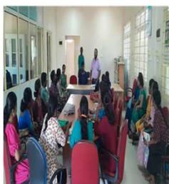
Jaffna Psychosocial Training