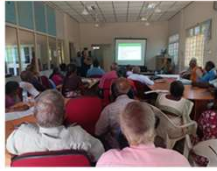
Jaffna District Disaster Awareness Program for Elders