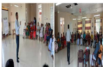
Mullativu Psychosocial training