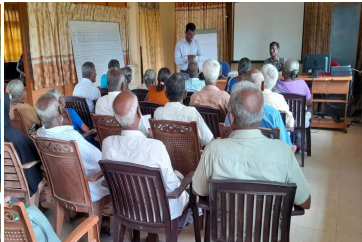
Mannar district Disaster management awareness Program for Disable