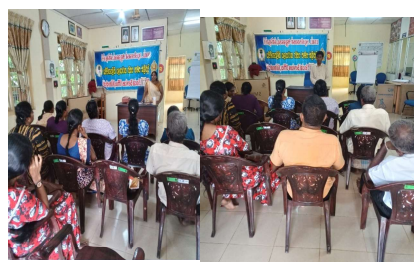
Kilinochchi Psychosocial training